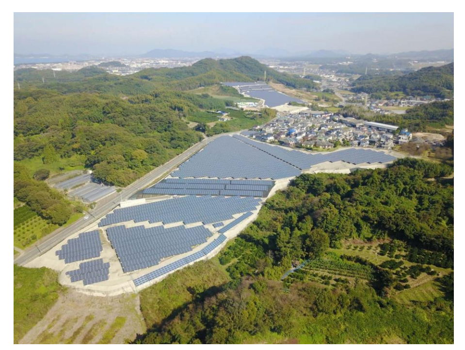
(Example) Solar power plant where jSEO provides O&M services

The company also started service at the Shibushi Matsuyama 1st, 2nd, 3rd Solar Power Plant (output: 2.2MWp) solar sharing (farm-based solar power generation) project that the Shizen Energy Group developed in Kagoshima Prefecture in April of this year. jSEO will continue offering services tailored to diversifying power generation businesses in Japan, including for roof-mounted equipment at plants and facilities.